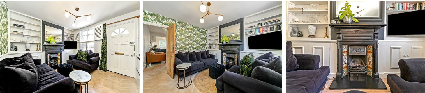
Ground Floor Approx. 348.5 sq. feet

A prime position close to the city centre, the mainline railway station with fast trains into London, and a good primary school, plus an attractive aesthetic appearance makes this three bedroom, two reception end terraced character cottage, a favoured address for professionals and commuters alike. The property is arranged over two floors and internally the property is beautifully presented with a contemporary feel yet retains its character. Practical living accommodation features a living room, the dining room, a lovely fitted kitchen with utility accessing the private enclosed rear garden, three bedrooms and a family sized bathroom. Sopwell Lane is a sought after address, conveniently located for ease of access to the city centre, historical attractions, restaurants and bars as well as the Thameslink mainline station..